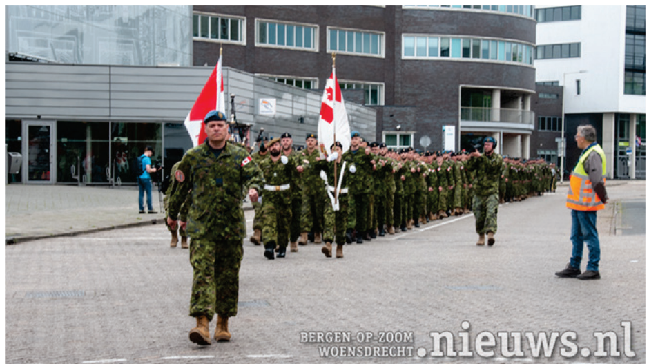
Click on photo for video

Four buses left from the cemetery to Plein 13 in Bergen op Zoom. From there, the Canadian contingent marched through the center of the city to the Markiezenhof.