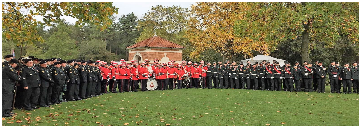
SALH and L&W detachment at the Canadian War Cemetery