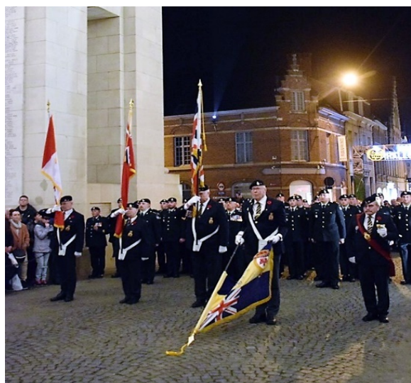
Ypres Menin Gate

Then the regiments and RCL 005 in the Netherlands took a peek at the Liberation Museum Zeeland in Nieuwdorp, rang the bell at the Liberation Monument Welberg (the Clock) in Steenberg, attended the Freedom of the City / Liberation parade in Bergen op Zoom and the Memorial at the Canadian War Cemetery in Bergen op Zoom. The Colour Party of Branch 005 was also present during the commemoration at the Sloedam and the commemoration at the Canadalaan in Bergen op Zoom. The RCL Zone Europe Commander and his wife were also present this weekend. The events were concluded with a reception in the Markiezenhof in the center of Bergen op Zoom. This event was organized by the Canadian Ambassador to the Netherlands and the Mayor of Bergen op Zoom. In a number of Facebook items photos and short reports are made of this trip, don't miss them! Many photos are also included on the RCL005.nl website.