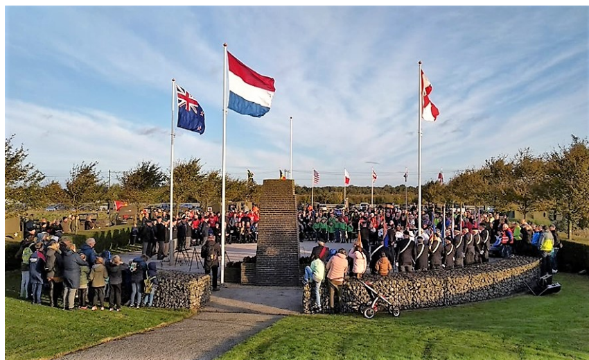
Commemoration Walcheren Causeway

Then the regiments and RCL 005 in the Netherlands took a peek at the Liberation Museum Zeeland in Nieuwdorp, rang the bell at the Liberation Monument Welberg (the Clock) in Steenberg, attended the Freedom of the City / Liberation parade in Bergen op Zoom and the Memorial at the Canadian War Cemetery in Bergen op Zoom. The Colour Party of Branch 005 was also present during the commemoration at the Sloedam and the commemoration at the Canadalaan in Bergen op Zoom. The RCL Zone Europe Commander and his wife were also present this weekend. The events were concluded with a reception in the Markiezenhof in the center of Bergen op Zoom. This event was organized by the Canadian Ambassador to the Netherlands and the Mayor of Bergen op Zoom. In a number of Facebook items photos and short reports are made of this trip, don't miss them! Many photos are also included on the RCL005.nl website.