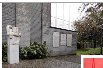
Eeklo, België 25-10-2019