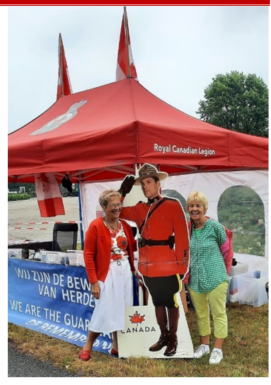
A Mounty, real or not, remains attractive, doesn't it, ladies?

Report: the day started dry, but ended W E T!!