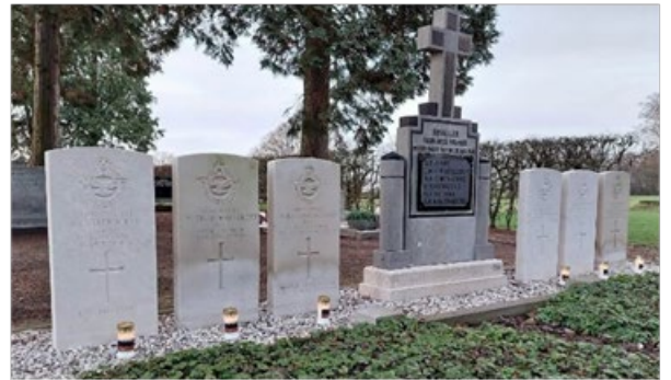
Halle - Gerrit Bruggink