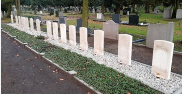
Zelhem - Gerrit Bruggink