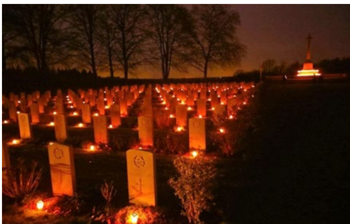
Groesbeek - Candles evening Groesbeek