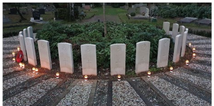
Vorden - Gerrit Bruggink