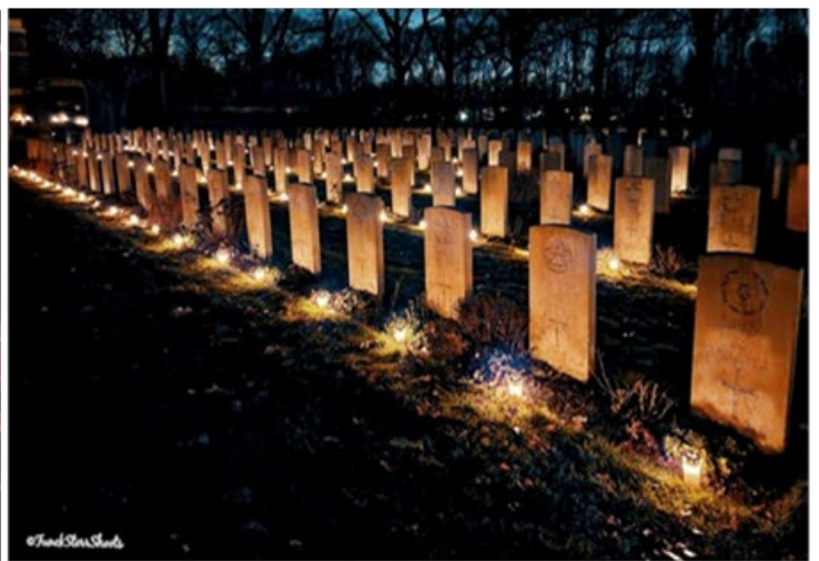
Oosterbeek - Funckstersshoots