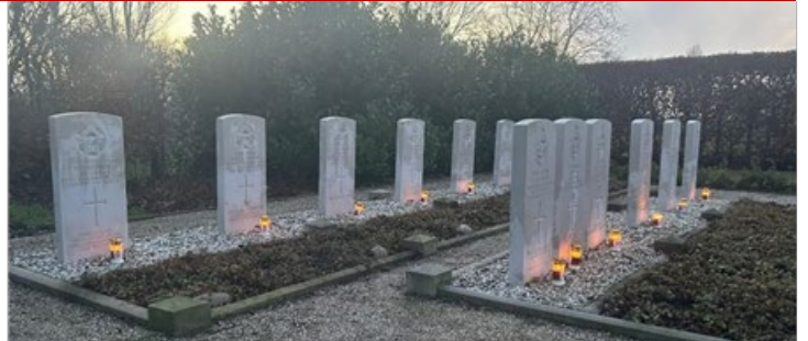
Wichmond - Gerrit Bruggink