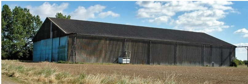
Hangar B1 on the former airfield is still there

The destination was the German port city of Lübeck on the Baltic Sea. Lübeck wasn't an important strategic military target, and there wasn't much anti-aircraft fire.