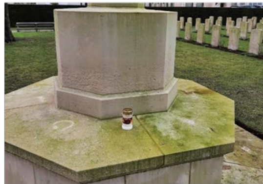
Nederweert - Gerrit Bruggink