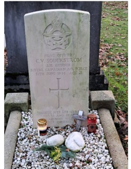
Ruurlo - Gerrit Bruggink