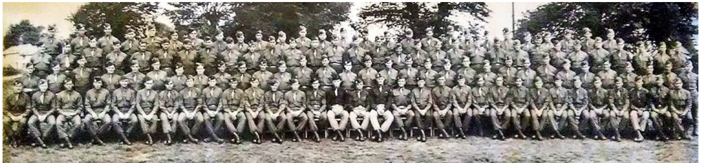
Men of the A- Coy of 501 PIR, 1944 somewhere in England

He took American nationality and enlisted in the US armed forces. After completing training, he was assigned to A Company, 1st Battalion of 501 Parachute Infantry Regiment. (Abbreviated: 501 PIR)