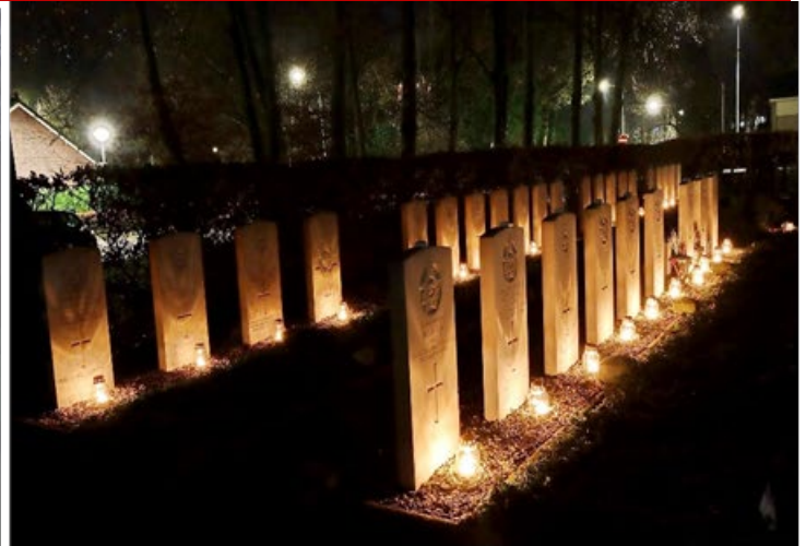
Gendringen – OWN