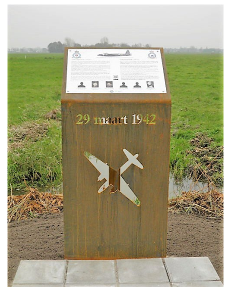
Memorial at the crash site