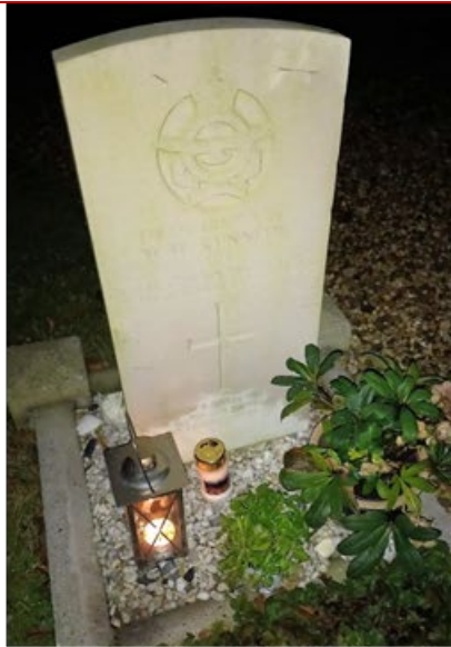
Baak - Gerrit Bruggink