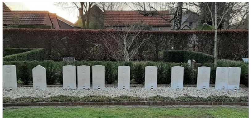
Steenderen - Gerrit Bruggink