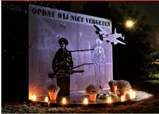
Oude IJsselstreek - OVN