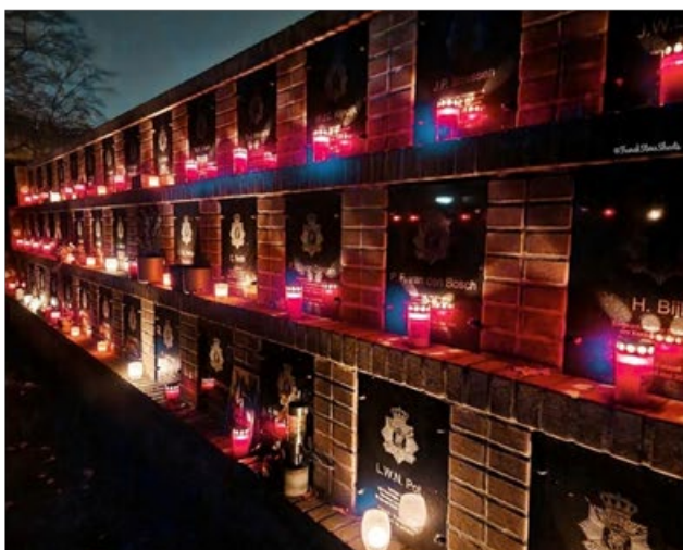
Bronbeek - Funckstersshoots