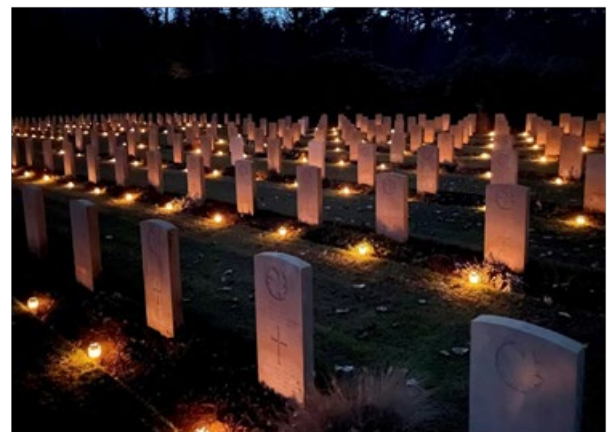
Holten - Wim Poppenk