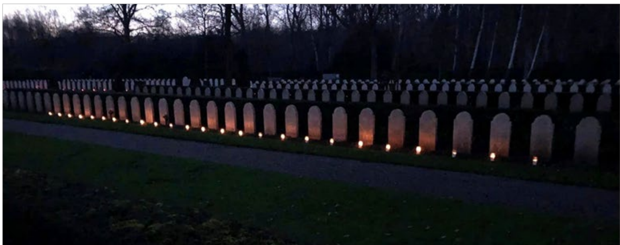
Grebbeberg – Henk van den Berg