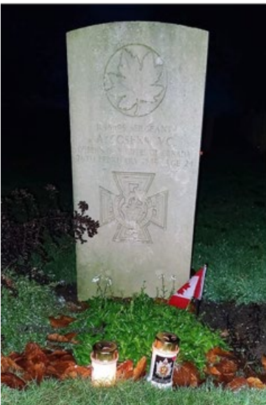
Groesbeek - Gerrit Bruggink