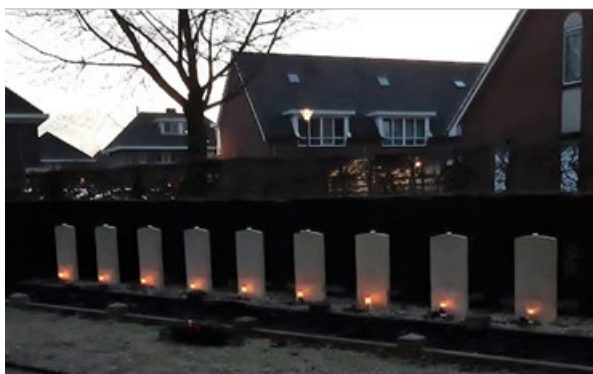
Varsseveld - Gerrit Bruggink