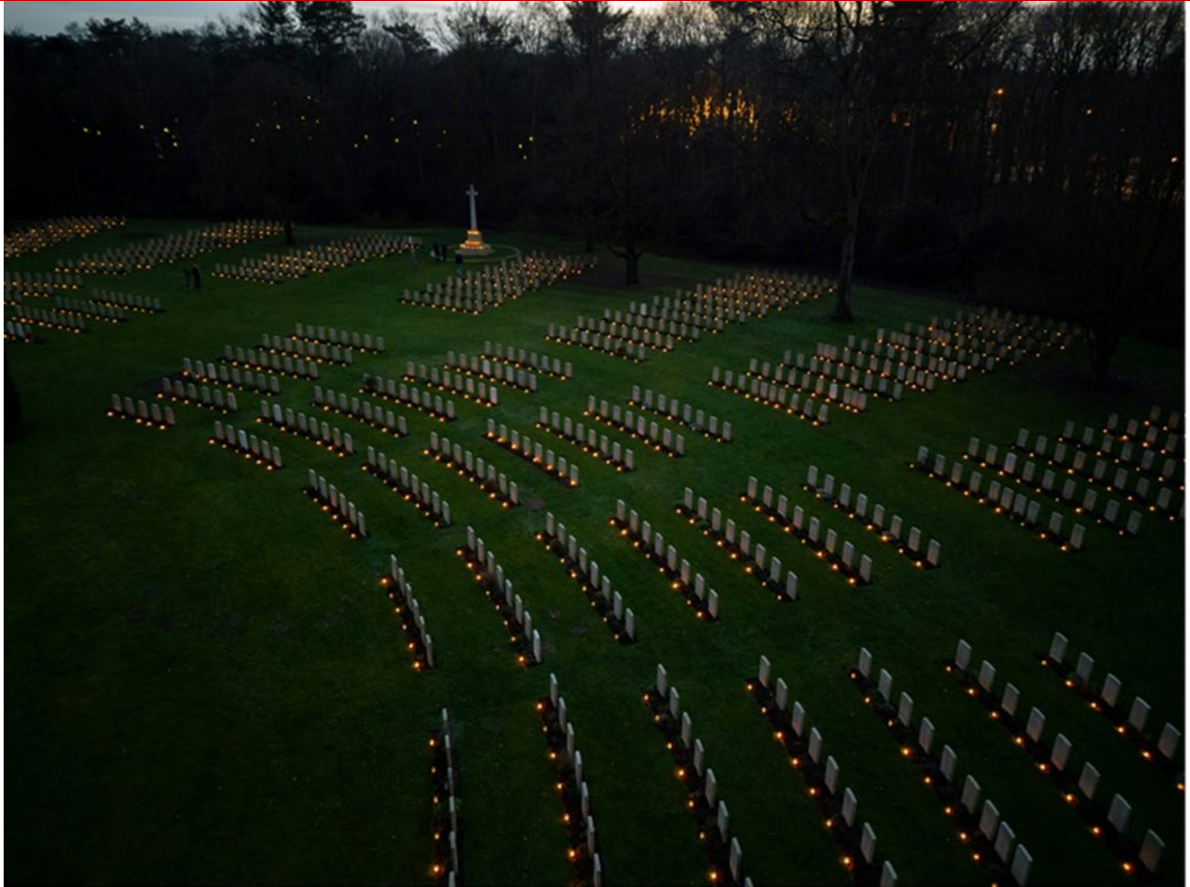
Jonkerbos - drones Nijmegen