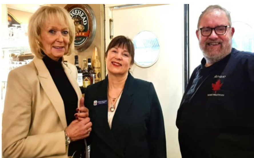
No words needed