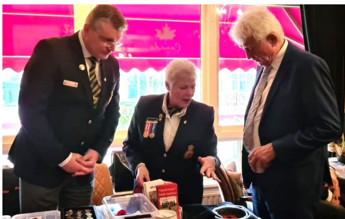
Sales continue for the Kitshop-team