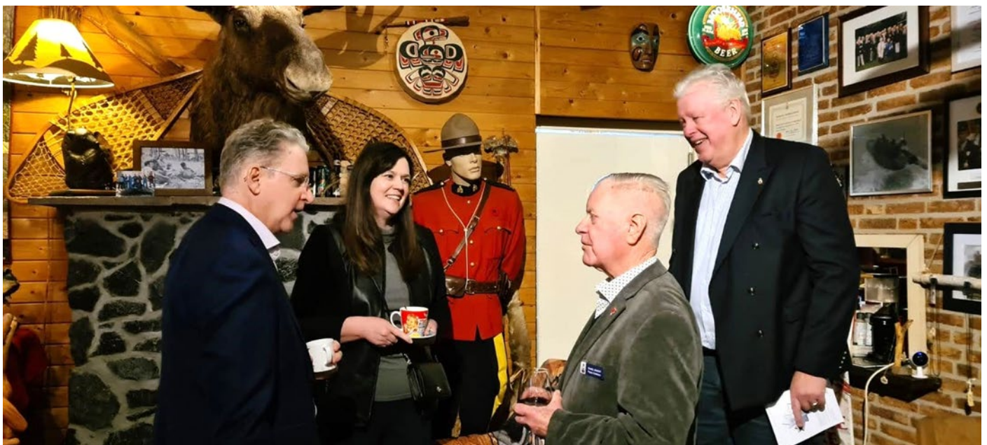
And the 'Mounty' kept an eye on things