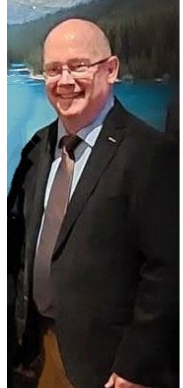
Colonel @ Canadian Armed Forces