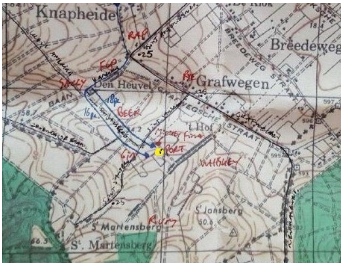
Map: Groesbeek Airborne Vrienden

This action was also 'practiced' in advance by the troops.