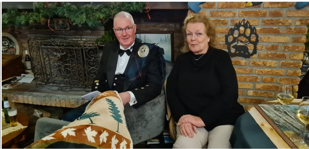
Look for the differences