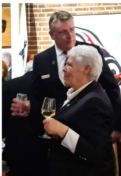
With a glass of wine