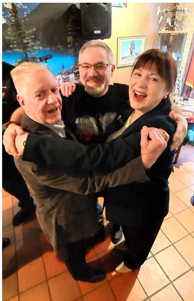
Three is a crowd? Not now, not here!!