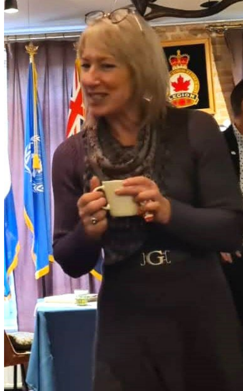
Sergeant @ Royal Canadian Air Force