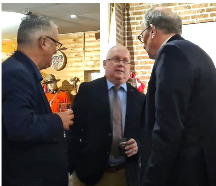
A serious conversation