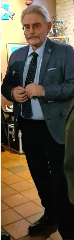
Sergeant @ Arms RCL Branch 005