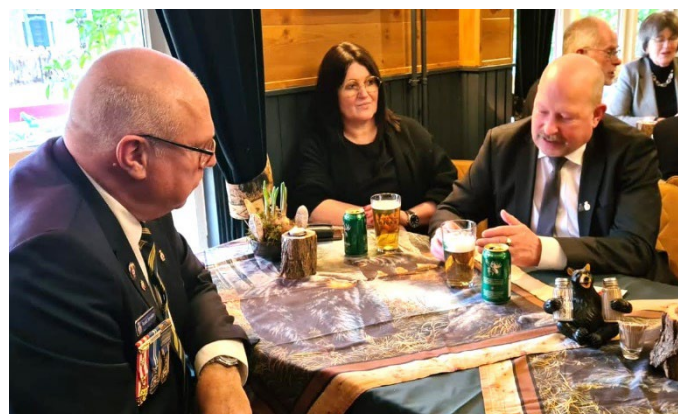
With a beer