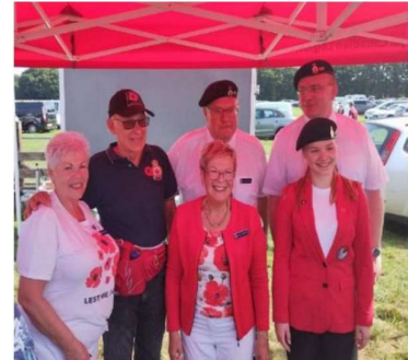
The RCL005 Promotion team with a guest from Canada

In the past, we attended three major events: the 4-Day Marches, the Airborne March, and at Ginkelse Heide. Last year, we held those events for the first time with our permanent promotion team. We also attended Poppy Day in Zandvoort with the Promotional Tent and Youth Auxiliary.